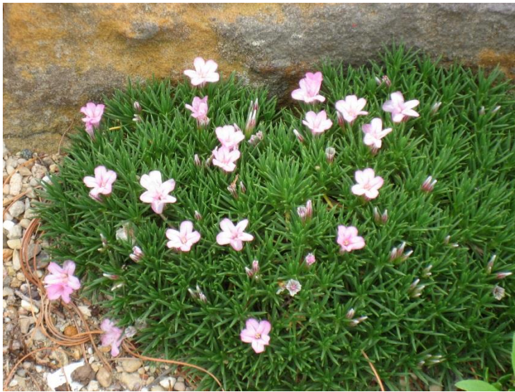
Acantholimons are notorious for their prickly cushions, but Acantholimon trojanum has much softer foliage and the pink flowers sit right on top of the cushion.