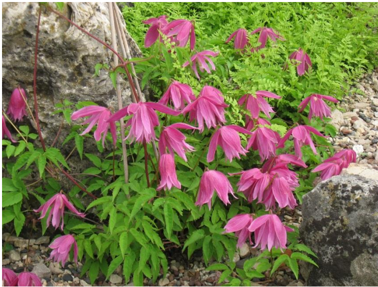
Clematis alpina 'Constance' was especially beautiful when it bloomed in our scree area in mid-May.