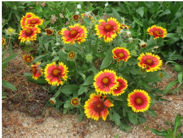
Gaillardia aristata is a mainstay of this garden and will continue to produce its flashy blooms throughout the summer.