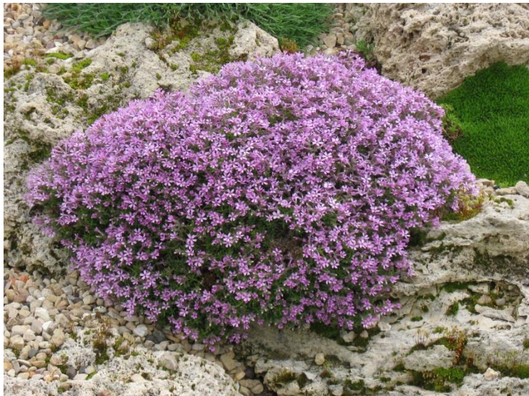
Phlox subulata 'Betty'

The next photos were taken in the moraine area where we have a trickle of water running under the planting medium on the north facing slope of the waterfall.