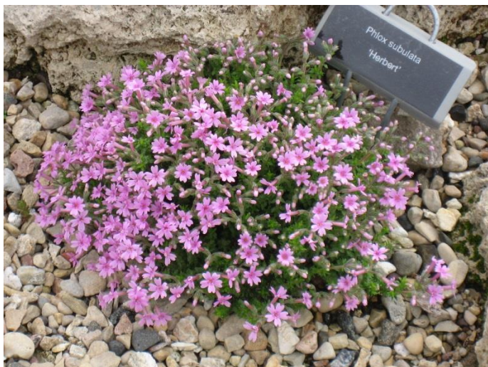
Phlox subulata 'Herbert'

Two very nice dwarf phloxes 'Betty' & 'Herbert' which originally came from the garden of Dick Redfield in New England, the leaves & flowers are both tiny.